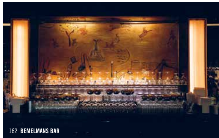
162 BEMELMANS BAR

Down the block from MoMA, B Bar is as stunningly beautiful as a palace, with elaborate namesake crystal chandeliers everywhere you look. At the bar, you may snag one of the bar stools for two (which seem to be popping up more and more). Cocktails will be elegantly presented in iconic Baccarat cut crystal glassware.