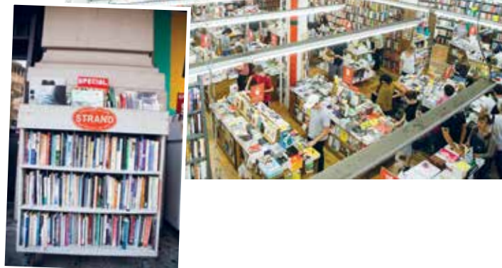
197 THE STRAND

Advertised as 18 miles of books, they offer services unlike any other bookstore, and can curate a library to match both your personality and decor. Their special first editions are the ones that collectors drool over. It's an easy way to kill an afternoon, strolling the aisles or thumbing through the cheap books set up on the sidewalk outside.